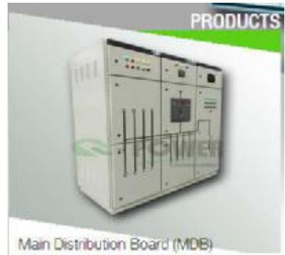
Main Distribution Board (MDB)